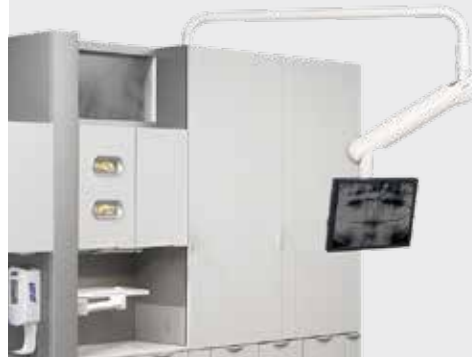
CENTRAL CABINET MOUNT