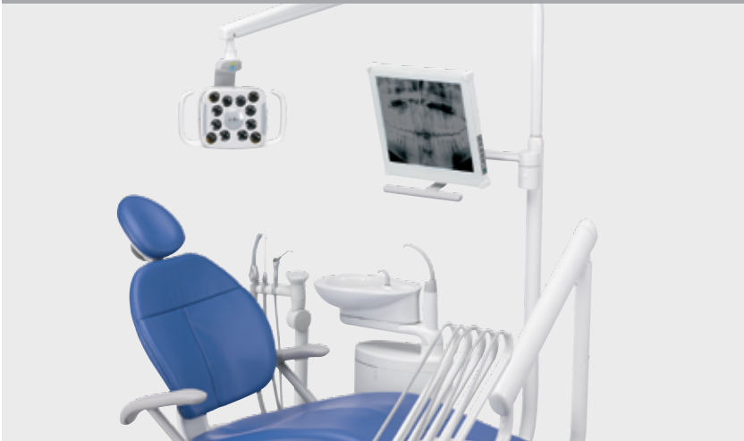
CHAIRSIDE MONITOR MOUNT

A chairside monitor brings the screen closer to the patient, so it's easier to discuss oral health, explain treatment procedures, and gain case acceptance.