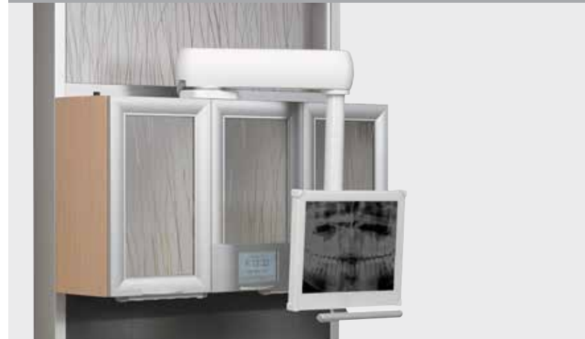
A-DEC INSPIRE® GLIDING MONITOR MOUNT

Integrate a monitor into A-dec Inspire® cabinets. The A-dec gliding monitor mount slides and pivots for picture-perfect positioning between you and your assistant. Mounted at 12 o'clock, it's out of the patient's direct view.